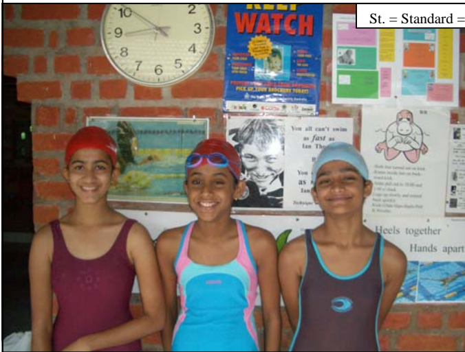
St. = Standard = Year Level