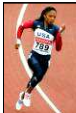
Allyson Felix: 200: 21.81 IAAF World Champs 2007

Warming Up for each event, appropriately, is part of each event.