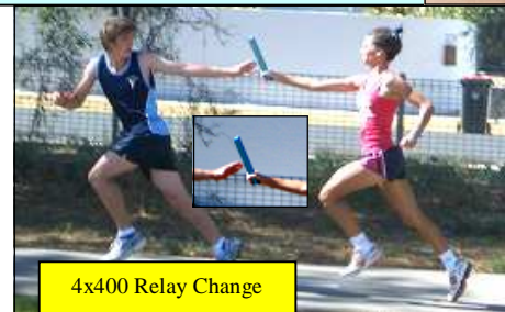
4x400 Relay Change

ONLY Plenty of Perfect Practice Produces Professional Performance