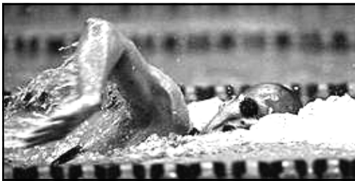
Bi-lateral Breathing (3/5): helps balance your stroke www.nwaswimaths.com