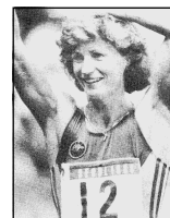
Debbie Flintoff-King (AUS) Olympic Champion, 1988 W400H: 53.17

Don't over-stretch; hold each stretch for at least thirty (30) seconds