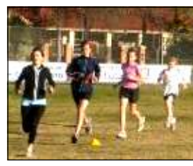
The early days