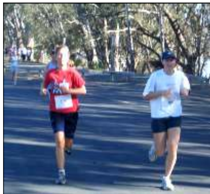
Sweat v Steam Fun Run, (Nov. 19, 2006)