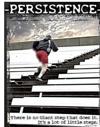
Usain Bolt ▶