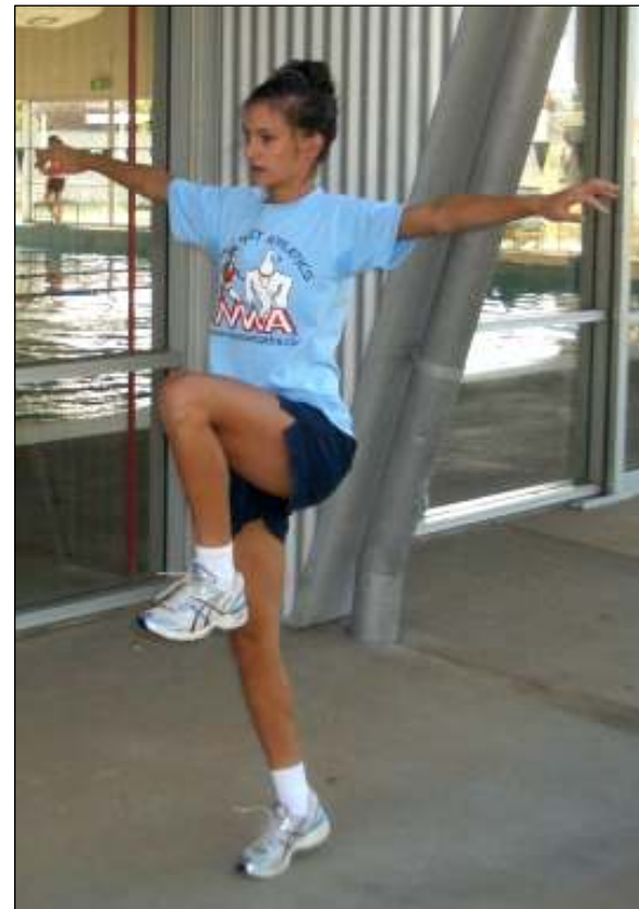
Karate Kid Hop