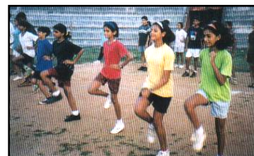
Australian Track & Field Coaches Association Level 4; Australian Swimming Coaches & Teachers Association - Bronze